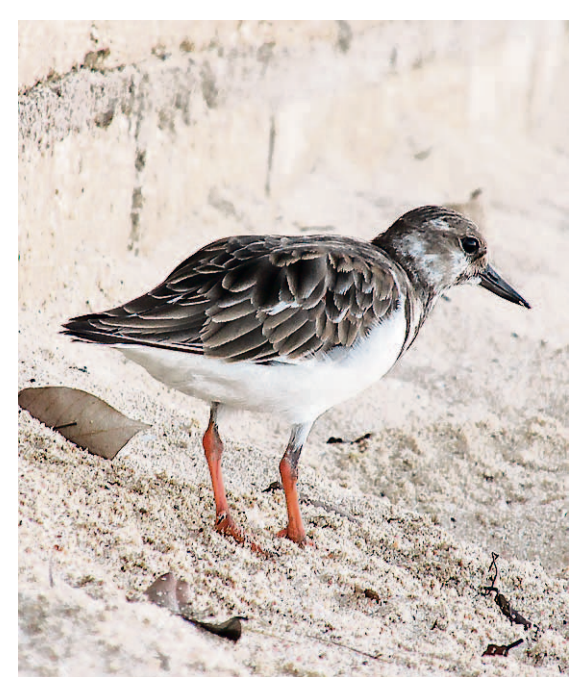
The shells and tourists have disappeared from Sunset Beach in Montego Bay, but birds, such as this one, still flock to it.