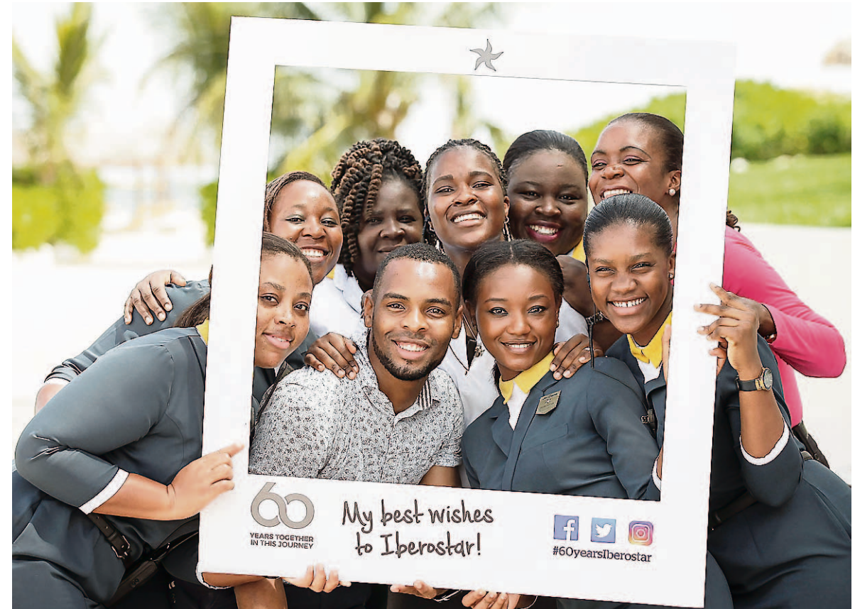
The Iberostar Grand team poses for the camera during the hotel group's 60th anniversary celebration on Saturday night.

"We would like to thank all of you that have accompanied us on this thrilling journey. Iberostar has been making dreams come true for 60 years now, being able to transform vacations into unforgettable moments," the group said.