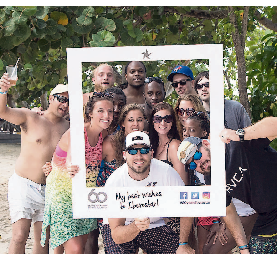
lberostar Beach guests having a blast at the 60th anniversary celebration of lberostar Rose Hall Beach & Spa Resort.