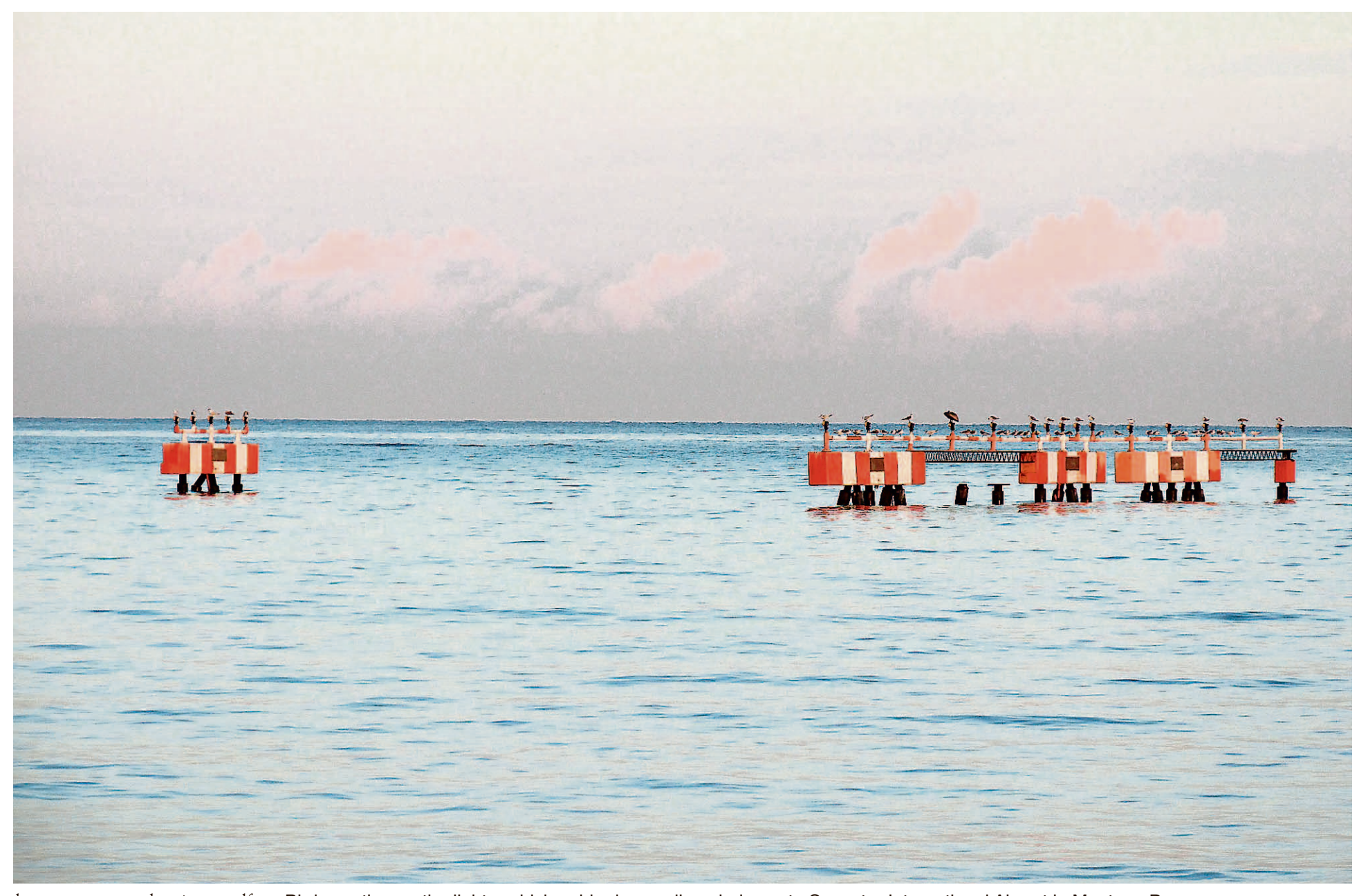
have grown up, and ageing myself, and the things I found funny then will soon be creeping up on me. And, I have been frequenting Sunset on my recent weekly trips to MoBay. I must say the calm and shallow water is still smelling and feeling clean. The morning temperature is also great. Yet, marine erosion has significantly reduced the size of the sand area.

The tourists, and the shells, like the 'double-deckers', have disappeared. Some crabs still abound, and so do some birds whose names I don't know. Buccaneer Inn, which was formerly the Sunset Lodge, a once-popular hotel, located directly across the road from the beach, is now a UWI Mona-WJC hall of residence. Those lucky students!