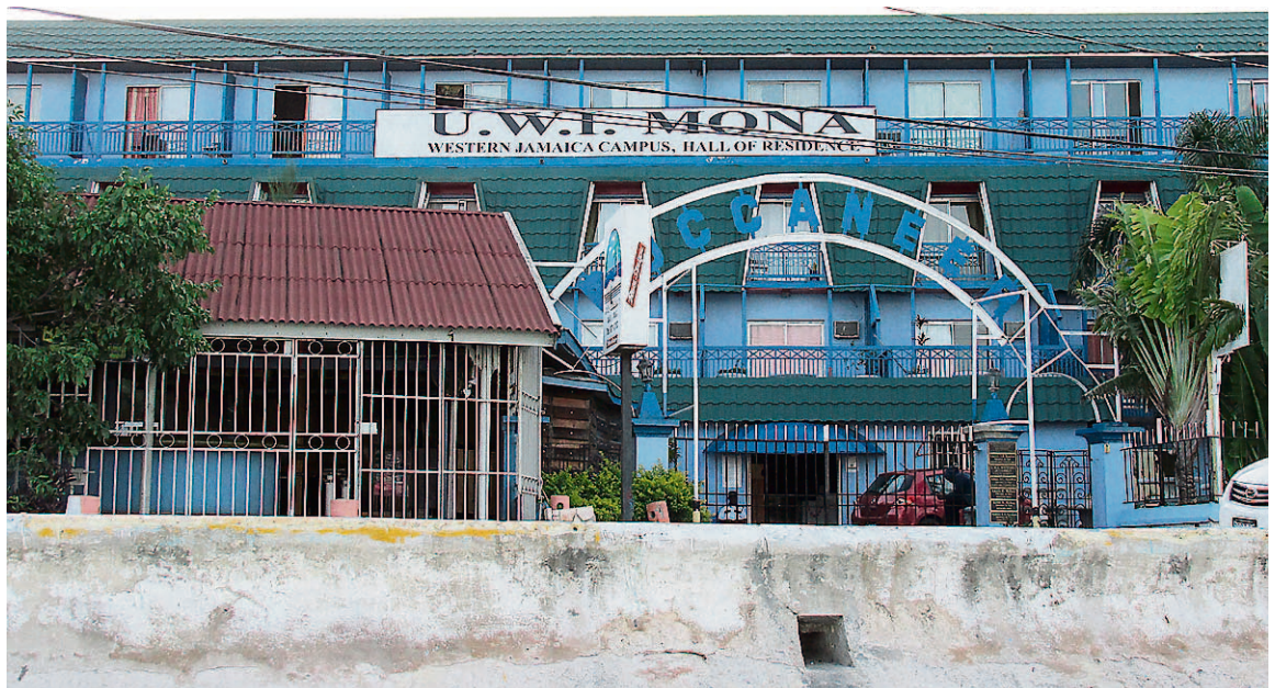
The once-popular Buccaneer Inn along Kent Avenue in Montego Bay is now a hall of residence for UWI Mona-Western Jamaica Campus students.

Eventually, the buses disappeared, and the road was cut off