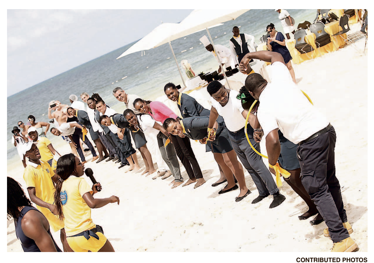
Beach Olympics at the Iberostar Grand ... management against guests

Their first hotels were situated on the finest beaches of Spain. Guided by the star of the Iberostar brand, the company embarked on an international expansion strategy in the Caribbean that took it to the world's finest holiday destinations.