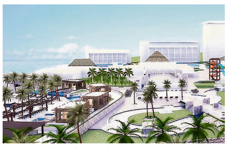
A rendering of Hotel Royalton Blue Waters.

Tourism stakeholders celebrating the success of the Jamaica Travel Market.