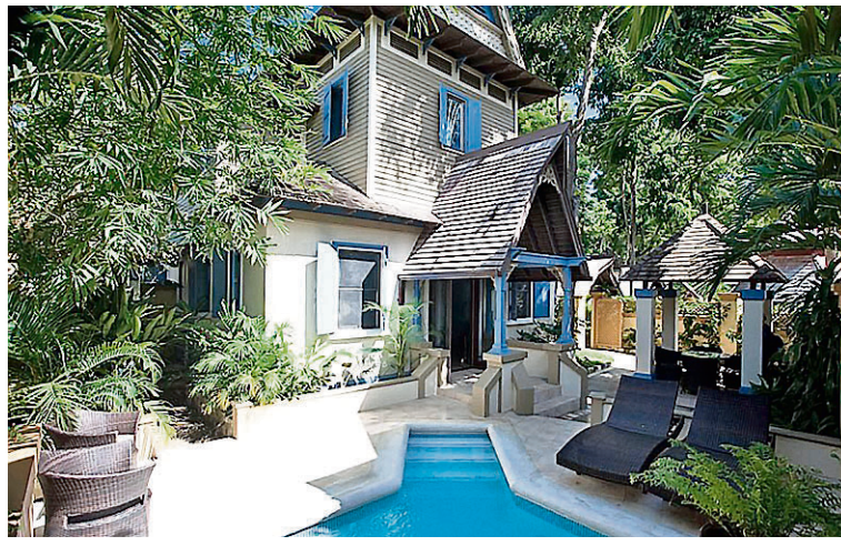
One of the nine villas at Hermosa Cove.

The winner of the Most Eclectic Award is presented to a property which is small and less prominent, yet extraordinarily beautiful and