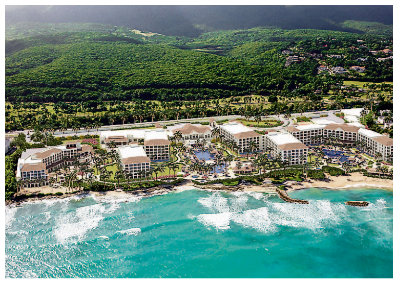
The Hyatt Ziva and Hyatt Zilara hotels at Rose Hall, Montego Bay.

"Developing our product is the key to future success, so it is essential that we continually ask what more we can do to keep pace with other world-class destinations," Bartlett advised.