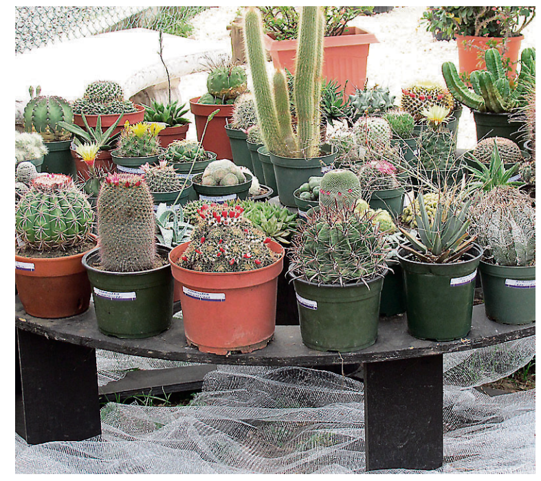
Cacti on show.

industry," Senator Grant said. He wants to lobby the Government in this regard, because the industry is poised to earn much foreign exchange as is the case of Australia, where horticulture is big business. "So, why not Jamaica?" Senator Grant asked. He expressed a desire for the JAS to collaborate with the JHS for the development of the horticultural industry. The setting up of a flower show at this year's Denbigh Show is one of the things he wants the JHS to do on its path to development.