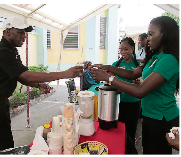
Students sampling hot coffee.