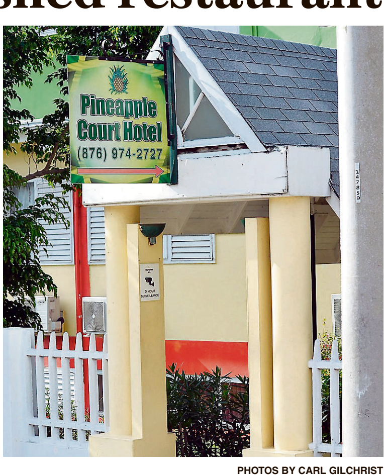
Pineapple Court Hotel