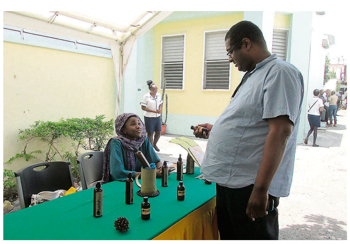
A patron inspecting cosmetics made of natural ingredients.