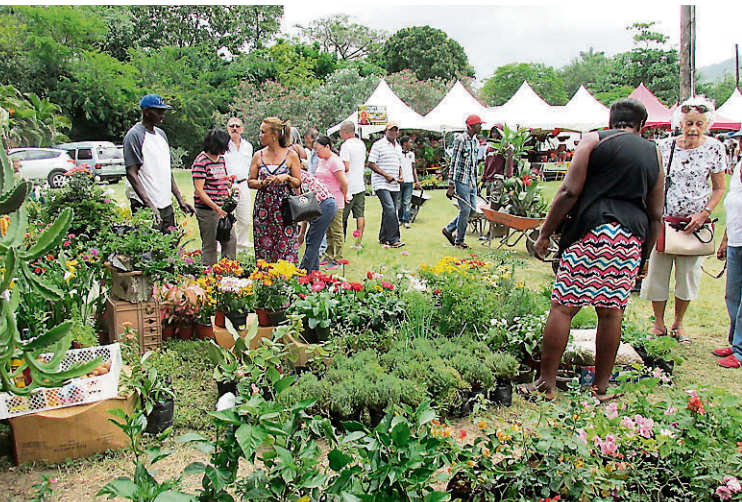
Patrons admiring plants at the recent Jamaica Horticultural Society flower show.