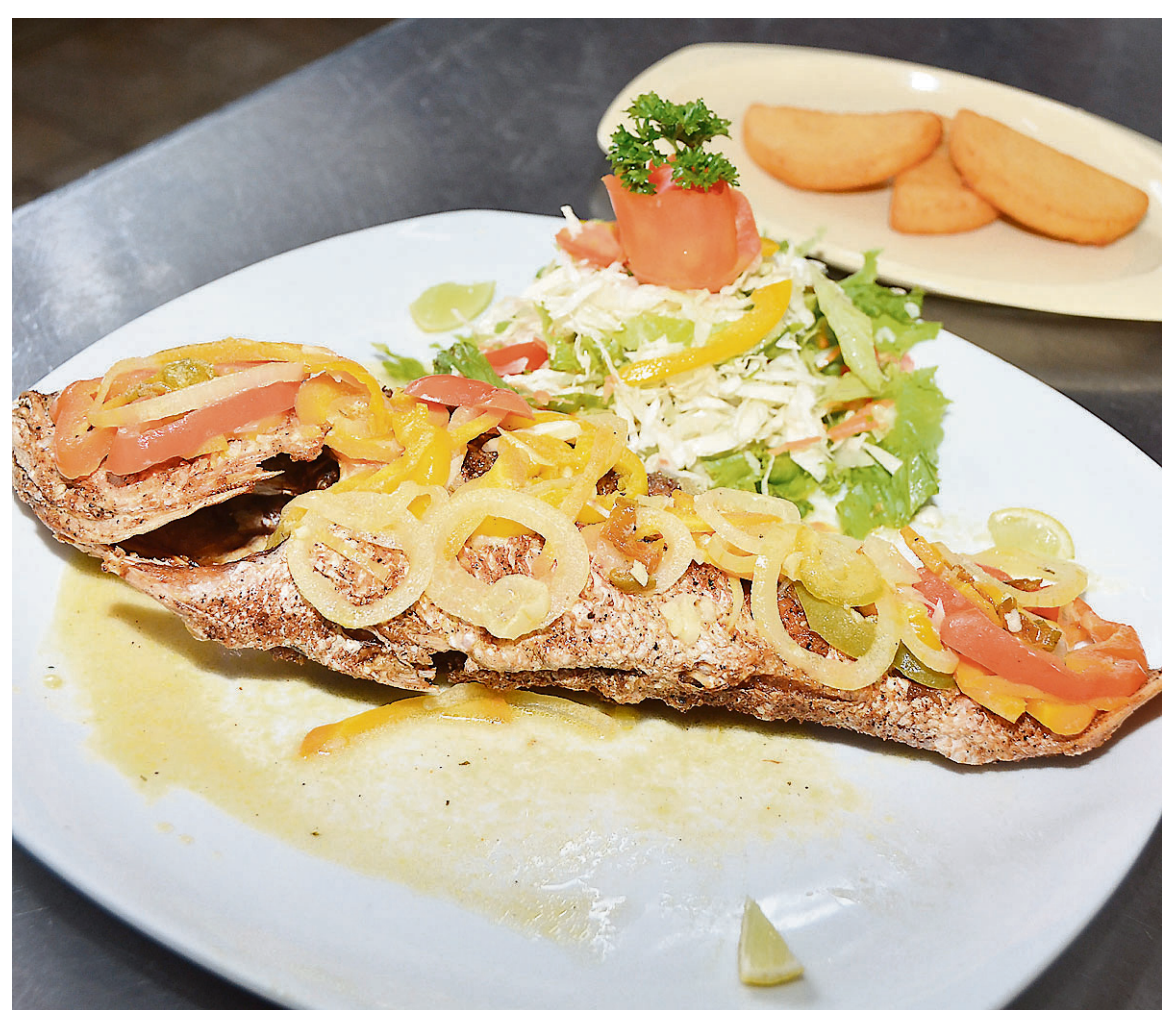
Escoveitched fish and bammy, one of the many meals on the menu at Tropical Bliss.