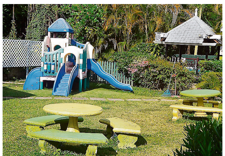
Kiddies' play area