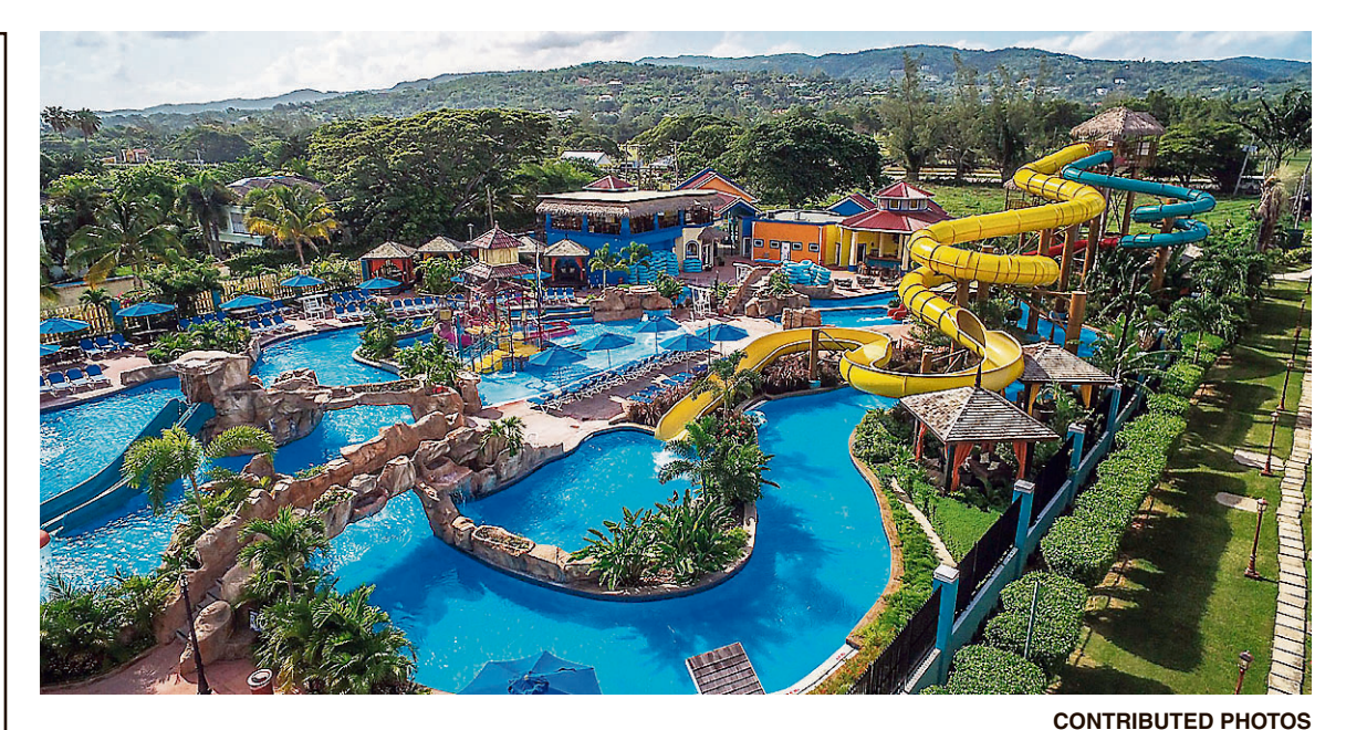
The water park at Jewel Runaway Bay.

The conference opens on the evening of Tuesday, January 30, and will be preceded by educational sessions that day. For more information, visit www.chtamarketplace.com or call +1 305 443-3040.