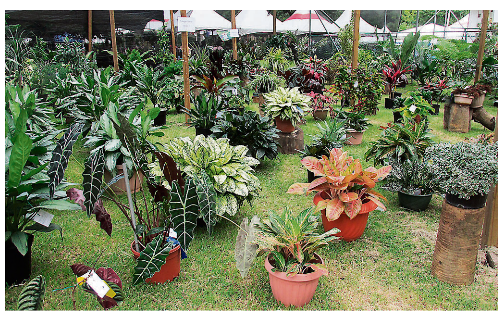
Some of the winning entries in the recent Jamaica Horticultural Society flower show.

And since I do not want to spend my last days in hunger, I will continue to nurture my fruit trees, and who knows, I might take on some horticultural work myself.