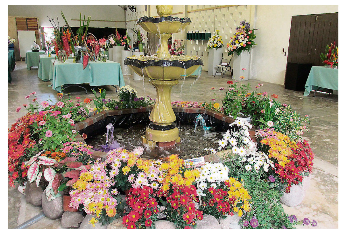
The Jamaica Horticultural Society flower show is a great opportunity to showcase landscaping products.