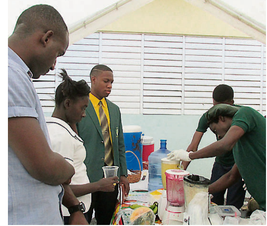
Patrons waiting for their smoothies from Ras Smoothies.