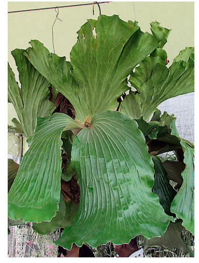
Staghorn ferns thrive better in wet, mountainous environments.