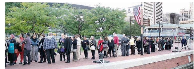
Over 100 travel professionals in Baltimore awaited registration and eagerly waited to board the Spirit of Baltimore Cruise of the Inner Harbor for an update on Destination Jamaica.

The ITB is hosting other trade shows throughout November in Connecticut, Rhode Island, Massachusetts, New Hampshire, North Carolina, and Arkansas.