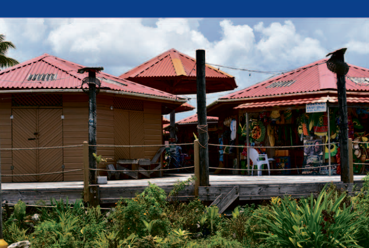
The craft development sub-sector boasts the island wide spread of sixteen (16) craft markets, across the parishes of Ocho Rios, Montego Bay, Port Antonio, Negril, Kingston and our newest development in Falmouth.

TPDCo continues to impact the lives of approximately 4,000 producers and traders, as we raise the awareness of the talents and capabilities of our Jamaican people.