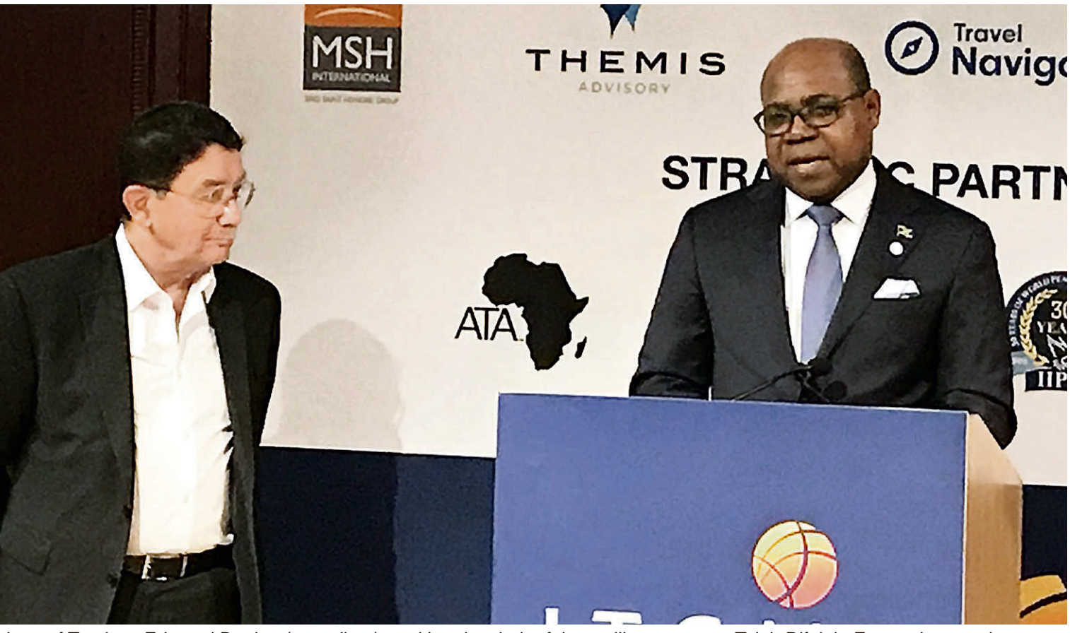
Minister of Tourism, Edmund Bartlett (at podium), and interim chair of the resilience centre, Taleb Rifai, in Europe last week.

The idea is that the centre will develop multiple activities and outputs: a monitoring and evaluation unit able to identify problems that have the potential to change or damage the industry; publicly available and interrogatable statistics, studies, and reports; a think tank;