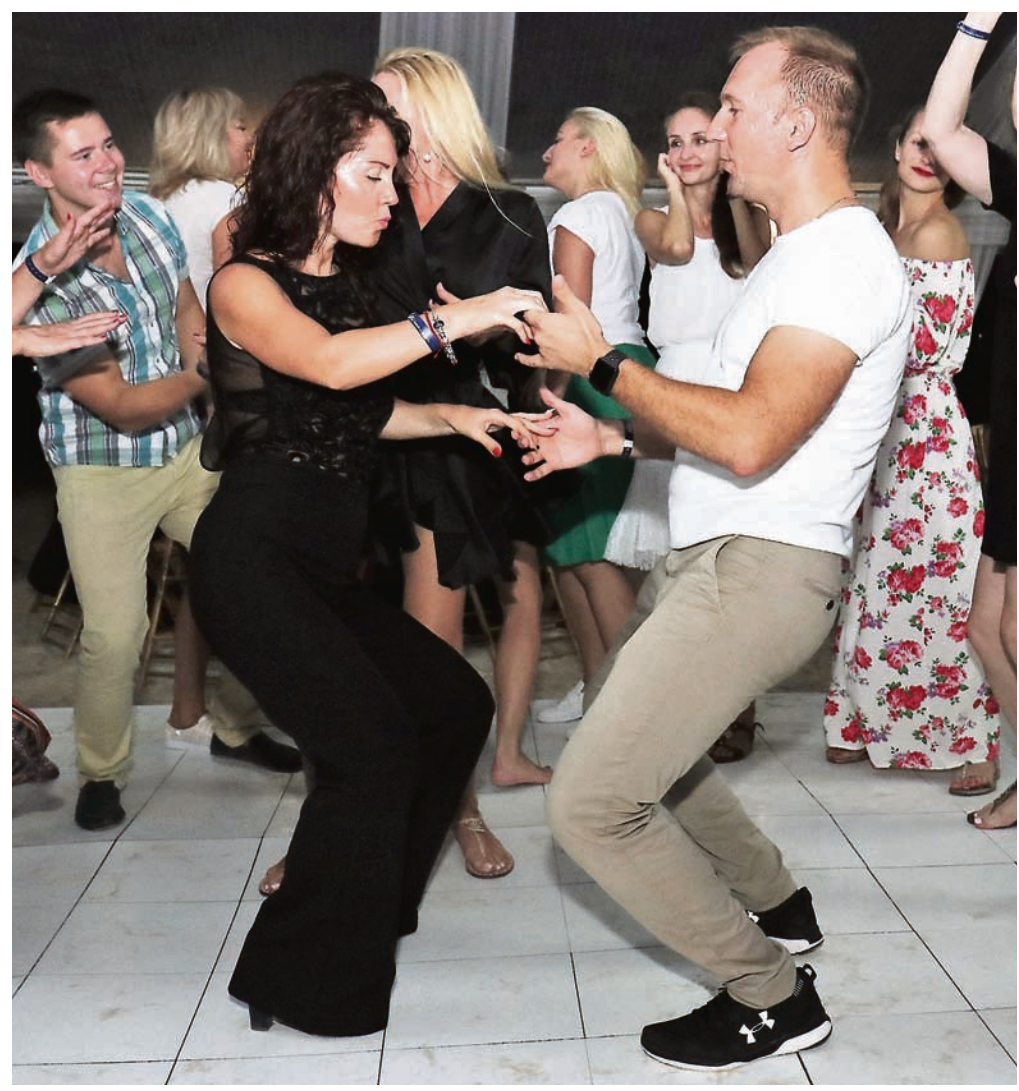
Russian tourists having a great time at RIU Negril last Thursday night

"They started with a charter flight, which they are going to be sending clients from now until May, and it is a new market so we want to cause a good impression for them to expand business with the Russian market, because it is a market with a lot of potential. Eventually, if this goes good – as this year is like the trial – we will have a Russian market coming to Jamaica with more frequency. It is beautiful to have people who are interested in learning the culture of such a beautiful country like Jamaica," she said.