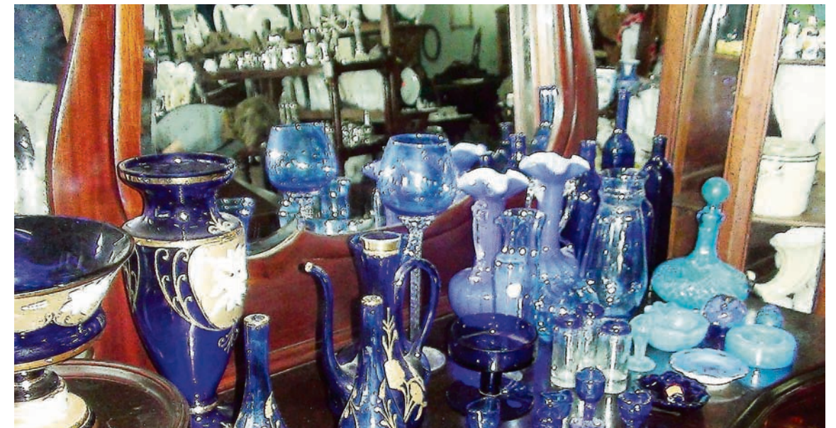
Those were the days when things were blue.