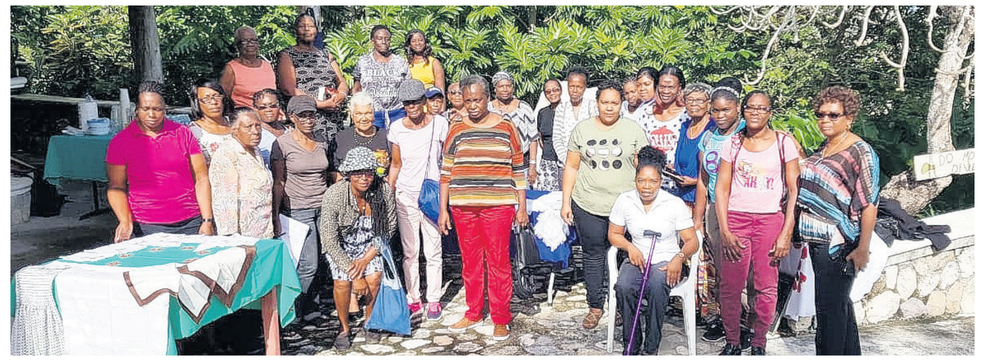
A cohort of trainees gather at the Rio Nuevo Great House.

training, the group was able to create a sustainability plan that will aid them in building and sustaining a viable enterprise that benefits the trainees and the community.