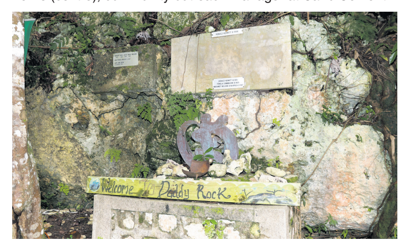
Woodside Ancestral Gardens.