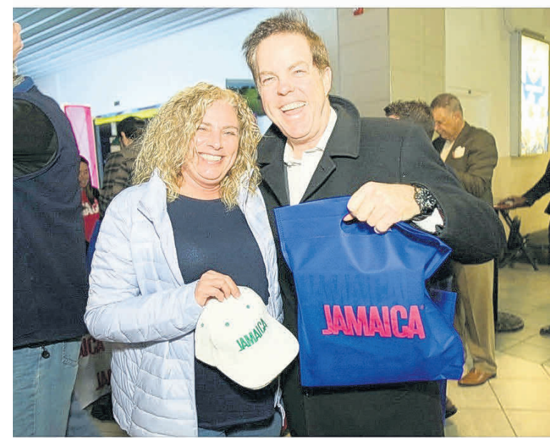
Hockey fans were happy to receive Jamaica-themed products.

of the media, industry partners, travel agents and tour operators, while enjoying the excitement of the hockey game. Guests tucked into a spread of Jamaican-inspired cuisine, including jerked chicken,