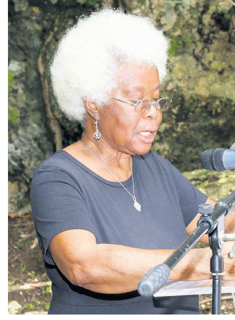
Dr Erna Brodber

Meant to be a sacred space, the Ancestral Gardens pays homage to the convergence of Taino, African and European presence.