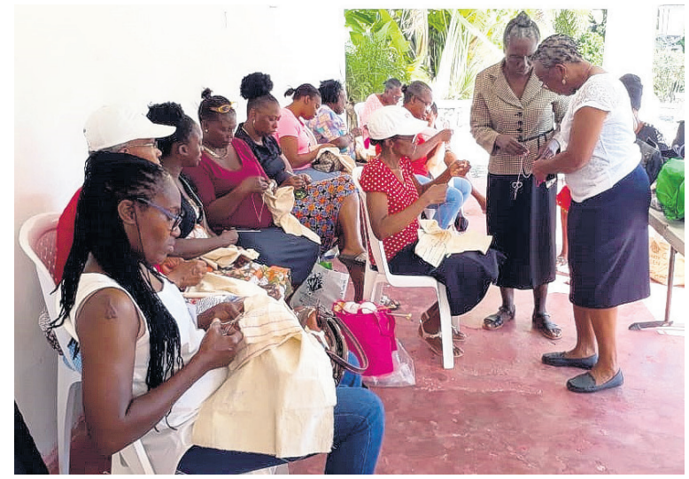
Women gather at the Bonny Gate Women's Group for training in hardanga and other needlecraft techniques.

The Bonny Gate Women's Group was established as one of several rural women's initiatives under the auspices of the nowdefunct Jamaica Women's League