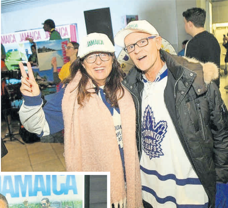
Estatic hockey fans.

beef sliders, lamb 'lollipops' and coconut shrimp, served alongside an open bar that offered Appleton Estate Rum.