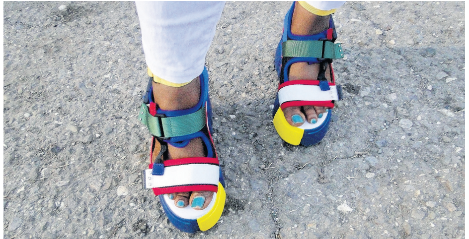
Whose shoes are these?

away from his owner. Another young man, with a French Christian name and a Chinese surname, donned Russian-style trousers and